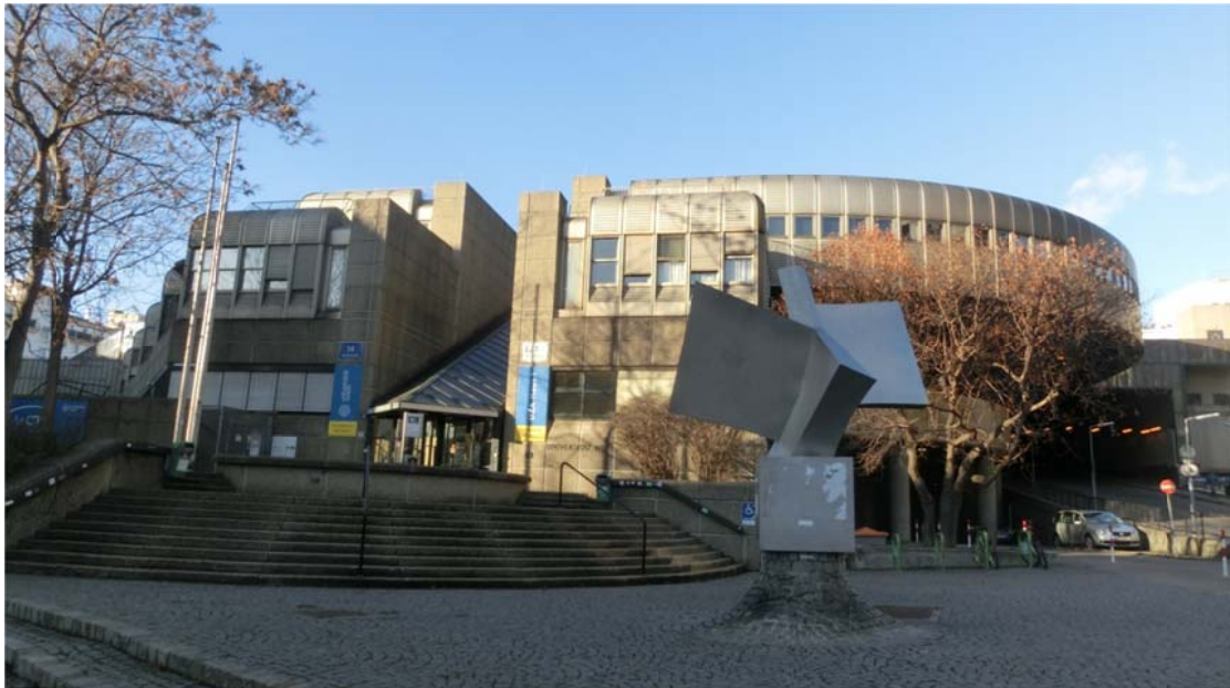
Main entrance to the Biocenter in the 9 th district. (marked in red below in the map)

Thursday, 25 th of May: 18:00 Registration & Icebreaker will take place at the University of University at the Biocenter in the 9 th district, Althanstraße 14.