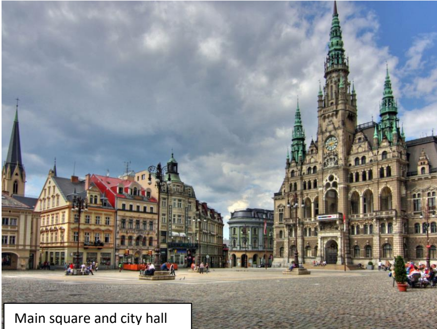
Main square and city hall

The zoo in Liberec was the first to be opened in Czechoslovakia in 1919. The zoo contains a wide