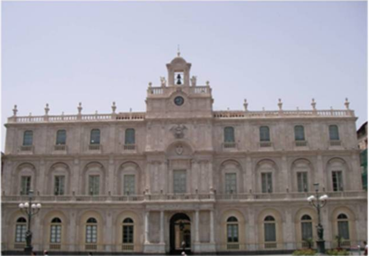
Catania University Central Building