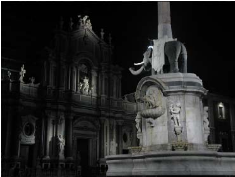
Catania main square with the S. Agata Cathedral and the Elephant, symbol of the city.

Several small hotels in Catania centre-town have prices ranging from 40-50 to 70 Euro. Cheaper prices could be available for students. The distance from the most eligible lecture hall about 10 minutes by bus, 15-25 minutes by foot. Several bars are placed near the lecture hall for quick lunch. For dinner, many restaurants and pizzerias are located in the “historic Catania” with a wide range of possibilities and prices (from 10-15 Euro upward).